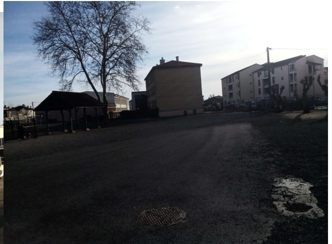
The school yard

The school restaurant occupies a central position. Located between the upper and lower courtyards, it provides an architectural link, but it's also a place of learning where several generations of schoolchildren learn to become responsible citizens.