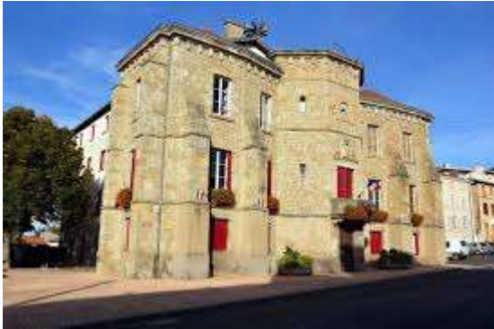
The city hall